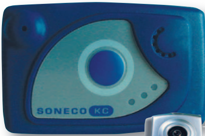
Care Communication Device made by Soneco.